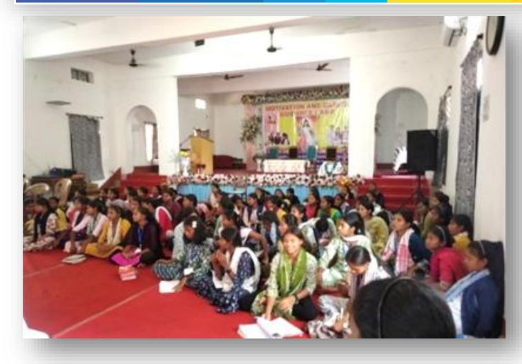
Vocation Camp and Sisters with a few potential Candidates