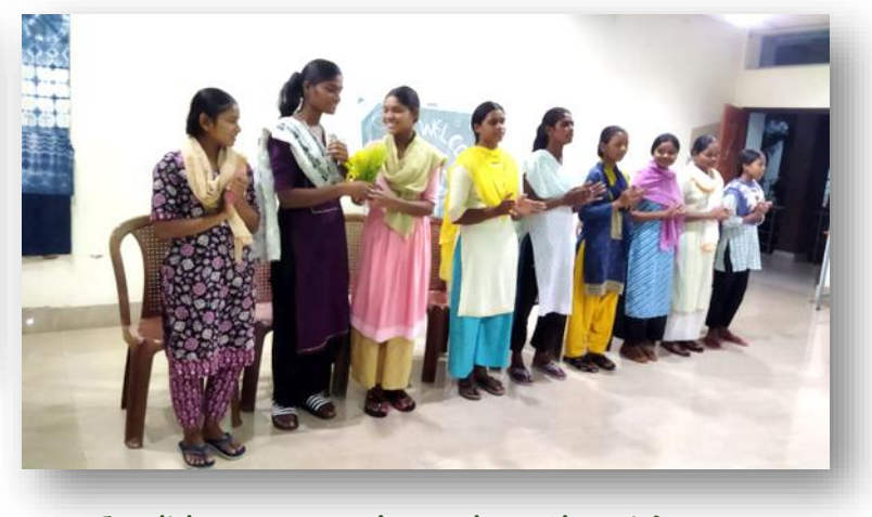
Candidates are welcomed to Shanti Deep