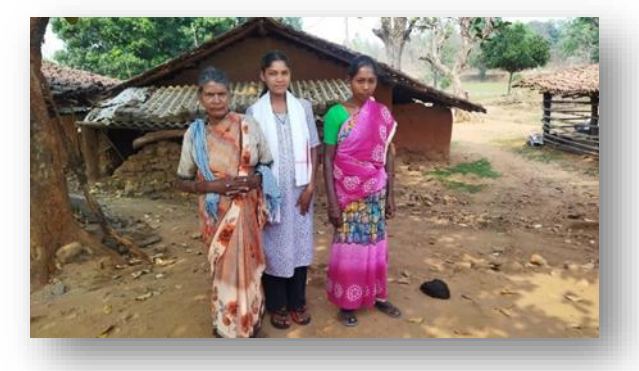
A Candidate before leaving home

We were blessed to welcome nine young women from various regions into our community for a two-month "Come and See" program , which officially began on April 2 . Upon arrival, the candidates were warmly received with songs and symbols of welcome, reflecting the openness and joy of our community life. This program aims to offer them a deeper experience of Marianist spirituality, prayer, community, and service, as they discern God's call in their lives.