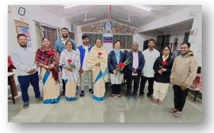
New Councillors with Nirmal Deep Community

From February 24 to 28, the newly appointed councillors participated in a retreat at Nirmal Deep SM Novitiate. The retreat served as a valuable time for spiritual reflection, teambuilding, and strategic planning. Through prayer, discussions, and workshops, the councillors deepened their understanding of their roles and renewed their commitment to serve the District with unity and purpose.