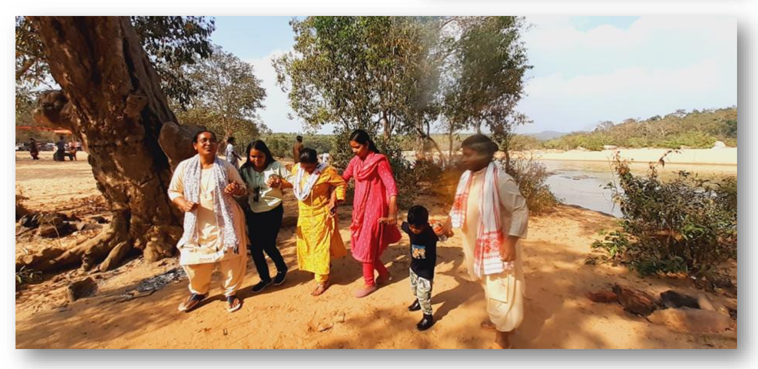
EYES Centre picnic